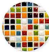
OLYMPIA Angie, Butterfly Blend