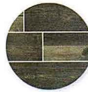
FIORANESE Cottage Wood, Brunito