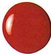
SHERWIN WILLIAMS Red Alert

The empty-nester owners of a midcentury modern rambler decided they wanted a fun and functional bathroom for their guests and grandkids. Everything stayed in place, but the finishes turned up the heat. Walls painted with Sherwin Williams in "Red Alert" add pizzazz, and the colorful mosaic tiles above the vanity and around the bathtub multiply the impact. Carrera marble countertops and wood-plank floor tile balance and ground the space.